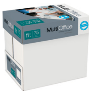
BOX IMAGE TO USE