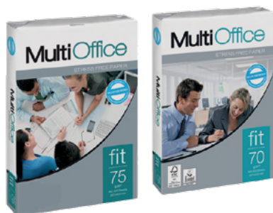
REAM IMAGE TO USE