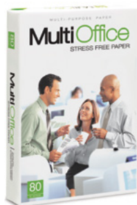
REAM IMAGE TO USE