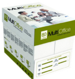
BOX IMAGE TO USE